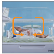
Dual radiant warmer